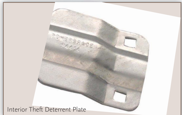
Interior Theft Deterrent Plate